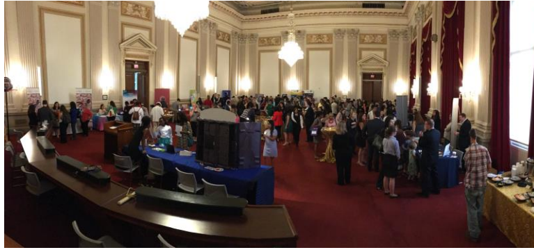
STEM Fair 2016