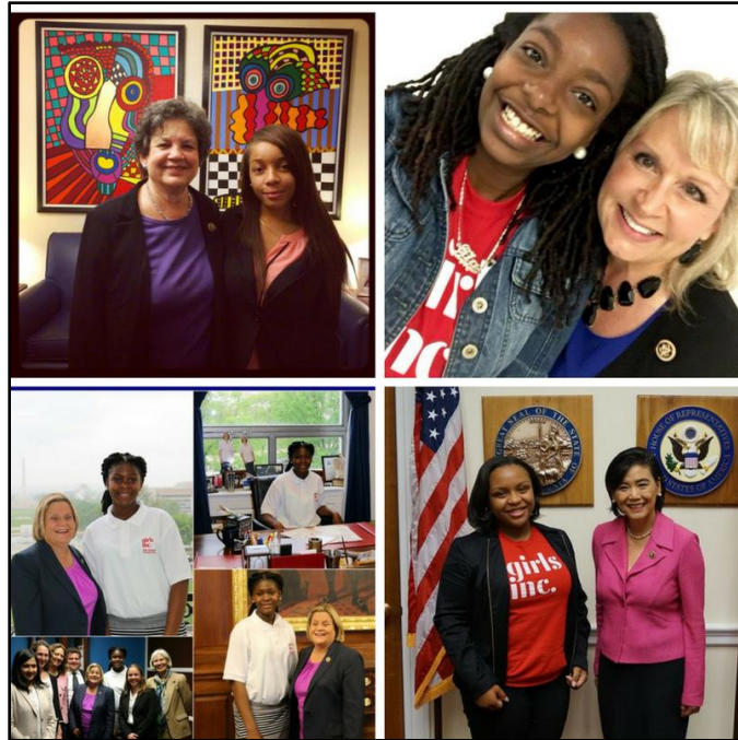
Reps. Lois Frankel (D-FL), Vice Chair, Congressional Caucus for Women's Issues, Renee Ellmers (R-NC), Ileana Ros-Lehtinen (R-FL), and Judy Chu (D-CA) participate in Take Our Daughters to Work Day.

Women Chiefs of Staff Program – Funded by a grant from the Democracy Fund , we took over administration of the Women Chiefs of Staff program in January, 2016.