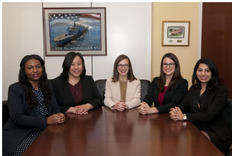
Class of 2016 WPI Congressional Fellows on Women and Public Policy

Fellows Program – Beginning in January, 2014, WPI became the new home for the Congressional Fellows on Women and Public Policy program. The fellowships are extended each year to a select number of graduate students with a proven commitment to equity for women. Fellows gain practical policymaking experience and graduate credit as they work from January to August in congressional offices. Fellows receive stipends for living expenses. The Class of 2016 included five fellows who worked in House, Senate, and committee offices. WPI celebrated the Class of 2016, their congressional sponsors, and past fellows from the program in June. We are grateful for the support of the fellowships by foundation, corporate, academic, and individual sponsors .