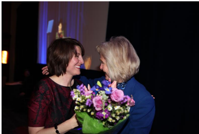
Republican Conference Chair Cathy McMorris Rodgers (R-WA), Women's Caucus Co-Chair, 110 th Congress, and Rep. Lois Capps (D-CA), Women's Caucus Co-Chair, 110 th Congress. Reps. McMorris Rodgers and Capps spoke about their work together on the occasion of Rep. Capps' retirement from Congress.