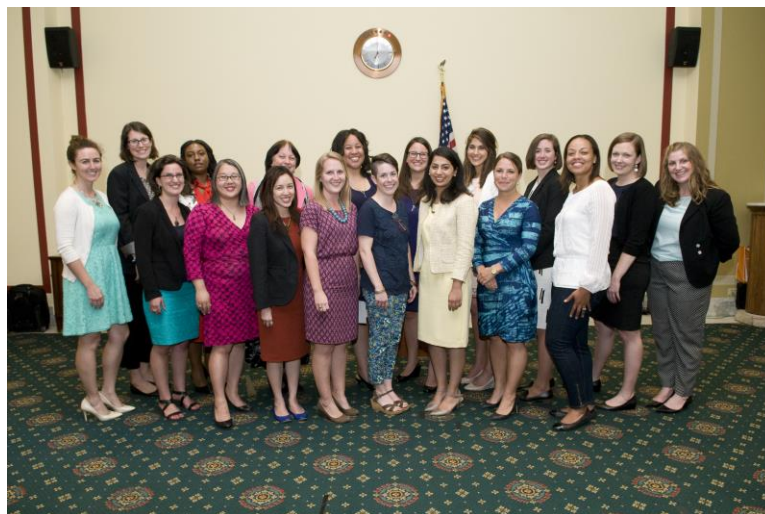
Group photo of past and current fellows taken at a June reception honoring the Class of 2016 WPI Fellows