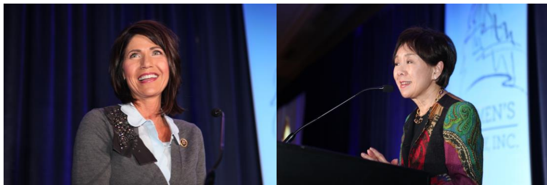
Women’s Caucus Co-Chairs, 114 th Congress, Reps. Kristi Noem (R-SD) and Doris Matsui (D-CA)