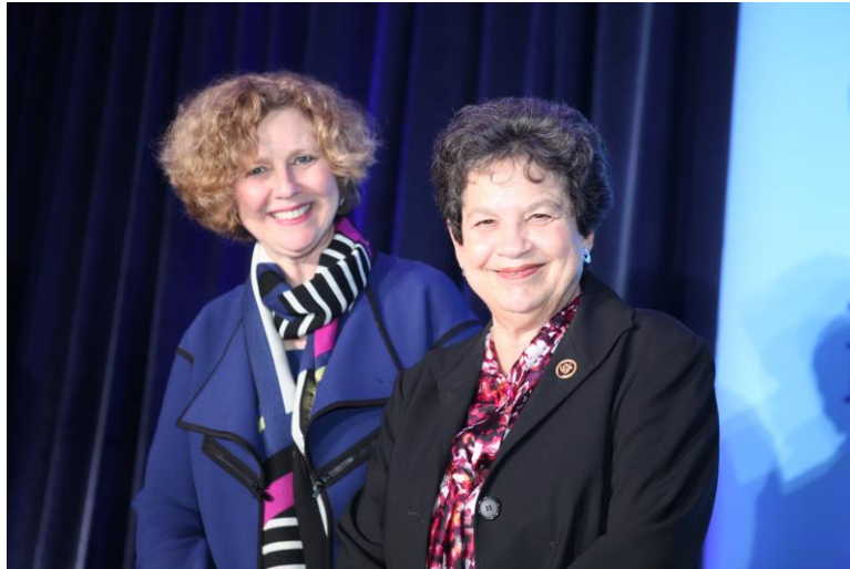
Women's Caucus Vice-Chairs, 114 th Congress Reps. Susan Brooks (R-IN) and Lois Frankel (D-FL)