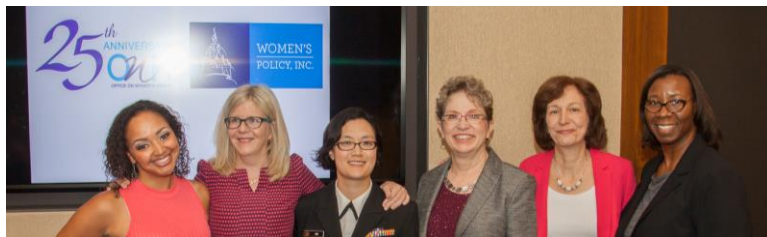
Panelists at the June 22 briefing on postpartum depression