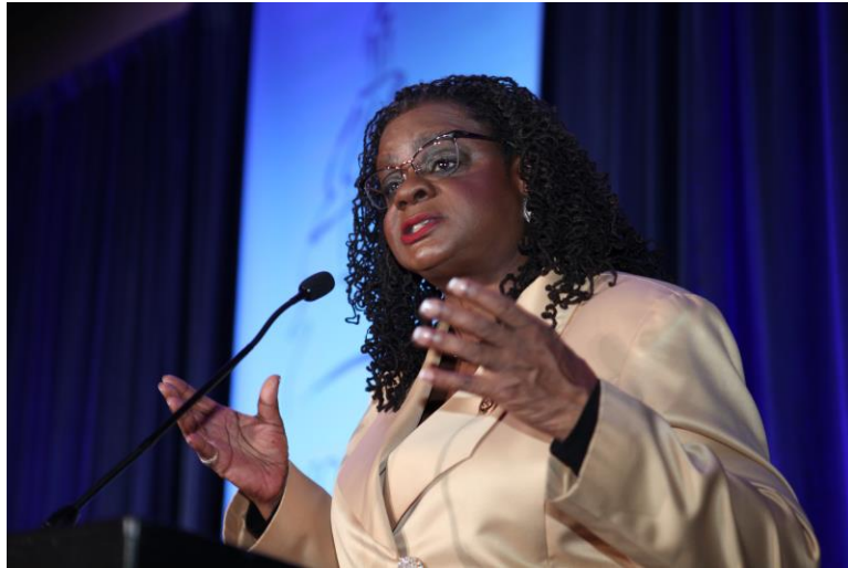
Rep. Gwen Moore (D-WI), Women’s Caucus Co-Chair, 112 th Congress, talks about working with retiring Rep. Cynthia Lummis (R-WY), Women’s Caucus Co-Chair, 112 th Congress.

Financial Reports – A breakdown of our revenues and expenditures for 2015 appears below. Our 2016 financial report will not be available until early next year.