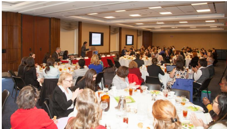
April 13 briefing on Rising Maternal Mortality Rates in the United States