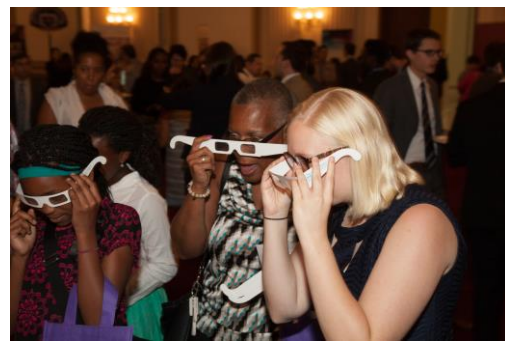
Participants at the 2016 STEM Fair and Reception