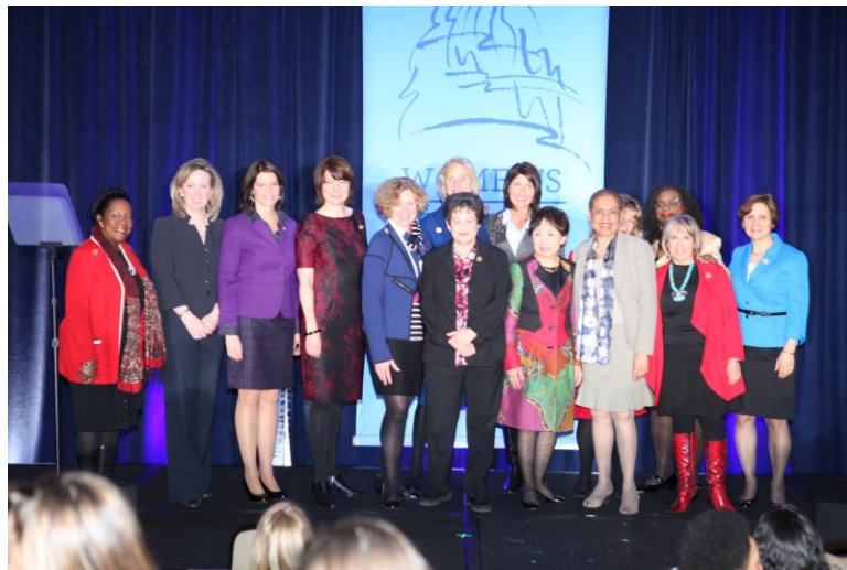
Group shot of women Members of Congress at the 2016 Congressional Gala

Annual Gala – In 2016, our annual gala celebrated the impact of women in the 114 th Congress and women Members of Congress retiring from public service. We were pleased to host 350 attendees, including 18 Members of Congress, high-ranking federal agency and administration officials, corporate and labor supporters, senior congressional staff, women’s group leaders, and the media. The event provides our core financial support for the year, and we are once again very thankful for the support of so many companies, labor unions, foundations, advocacy organizations, and individuals.