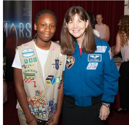
Girls participate in STEM projects at STEM Fair (left); Girl Scout and NASA astronaut Cady Coleman (right)