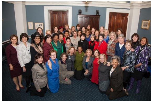
Group photo of women Members at reception for new women Members

Women Members – WPI serves as a resource for the women Members of Congress and their staff, as well as other congressional offices and the public, on women's issues in Congress and the history of the Congressional Caucus for Women's Issues. WPI sponsors a number of meetings and receptions each year open only to women Members of Congress in an effort to strengthen the Caucus. Among our events in 2015, we sponsored our biennial gavel-passing ceremony celebrating the new leadership of the Caucus and welcome reception for the new women Members, our annual Take Our Daughters to Work Day with Girls Inc., at which girls shadow the women Members of Congress, and several meetings focused on legislative issues of interest featuring guest speakers.