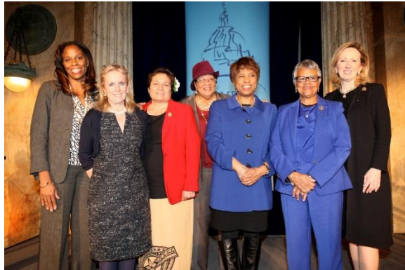
Group shot of new women Members of Congress – 114 th Congress Del. Stacey Plaskett (D-VI), Rep. Debbie Dingell (D-MI), Del. Aumua Amata Radewagen Coleman (R-AS), Reps. Alma Adams (D-NC), Brenda Lawrence (D-MI), Bonnie Watson Coleman (D-NJ), and Barbara Comstock (R-VA)

A breakdown of our revenues and expenditures for 2014 appears below. Our 2015 financial report will not be available until early next year.