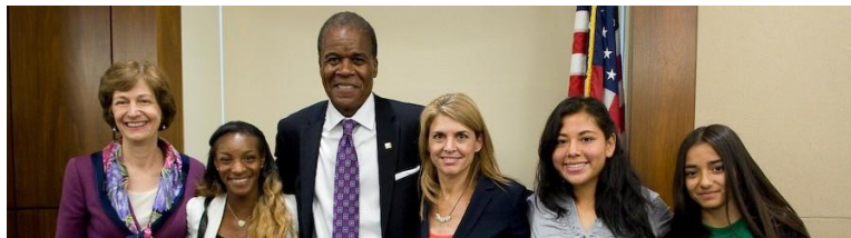
Panelists at the June 14 briefing on the importance of sports for girls' health

Fellows Program – Beginning in January, 2014, WPI became the new home for the Congressional Fellows on Women and Public Policy program. The fellowships are extended each year to a select number of graduate students with a proven commitment to equity for women. Fellows gain practical policymaking experience and graduate credit as they work from January to August in congressional offices. Fellows receive stipends for living expenses. The Class of 2015 included five fellows who worked in House, Senate, and committee offices. WPI celebrated the Class of