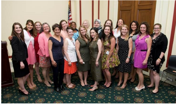
Group photo of past and current fellows taken at June reception honoring the Class of 2015 WPI Fellows

2015, their congressional sponsors, and past fellows from the program in June. We are grateful for the support of the fellowships by foundation, corporate, academic, and individual sponsors.