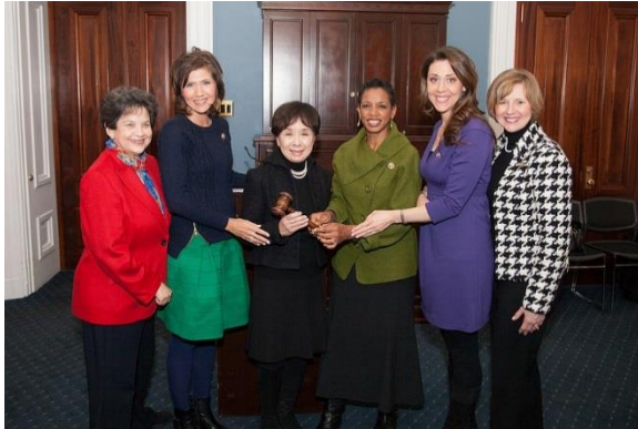
Passing of the gavel from 113 th Congress co-chairs, Reps. Jaime Herrera Beutler (R-WA) and Donna Edwards (D-MD) to new co-chairs, Reps. Kristi Noem (R-SD) and Doris Matsui (D-CA) and vice-chairs, Reps. Susan Brooks (R-IN) and Lois Frankel (D-FL)

Congressional Staff Briefings – WPI hosts congressional staff briefings on key women’s issues most months Congress is in session, with three briefing series: women’s health, international issues, and 21 st century workforce issues. Briefings in 2015 have included: the role of sports in improving girls’ health, our annual STEM Fair, celebration of the 25 th anniversary of the National Institutes of Health Office of Research on Women’s Health, the silent epidemic of Hepatitis C on women and their families in the U.S. and abroad, women veterans’ health issues, and the impact of workplace wellness programs on women’s health. We are grateful for the financial support for our briefings from the foundation, corporate, and labor communities.