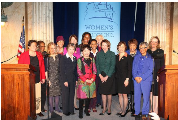
Group shot of women Members of Congress at the 2015 congressional dinner celebrating the record number of women in Congress and the new leadership of the Women’s Caucus

Annual Gala – In 2015, our annual gala celebrated the record number of women in Congress and new leadership of the Congressional Caucus for Women’s Issues. In spite of an imminent snowstorm, we were pleased to host almost 400 attendees, including 18 Members of Congress, high-ranking federal agency and administration officials, corporate and labor supporters, senior congressional staff, women’s group leaders, and the media. The event provides our core financial support for the year, and we are once again very thankful for the support of so many companies, labor unions, foundations, advocacy organizations, and individuals.