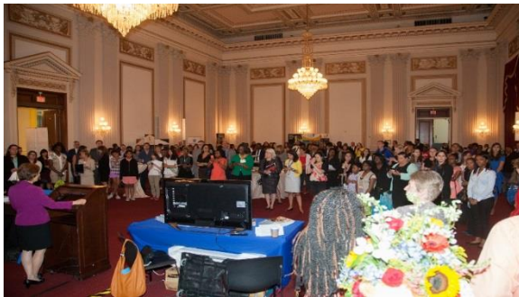
STEM Fair 2015

Congressional Staff Briefings – WPI hosts congressional staff briefings on key women’s issues most months Congress is in session, with three briefing series: women’s health, international issues, and 21 st century workforce issues. Briefings in 2015 have included: the role of sports in improving girls’ health, our annual STEM Fair, celebration of the 25 th anniversary of the National Institutes of Health Office of Research on Women’s Health, the silent epidemic of Hepatitis C on women and their families in the U.S. and abroad, women veterans’ health issues, and the impact of workplace wellness programs on women’s health. We are grateful for the financial support for our briefings from the foundation, corporate, and labor communities.